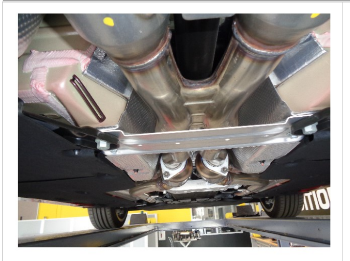
Step 1. To extract the OEM exhaust system you will first need to remove the brace located in front of the factory resonator. Next un-fasten the flanges located behind the catalytic converters and resonator and disengage all welded hangers from the rubber insulators. Do not damage or discard the rubber insulators or fasteners as they will be re-used to mount the new system. You can now remove the exhaust from the vehicle.