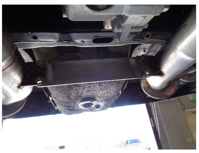
Step 3: Next Install the Muffler Assemblies to the outlets of the Resonator Assembly using the supplied 2.50" clamps. Insert hangers into rubber insulators. At this time loosely attach the Magnaflow logo brace to tie the muffler assemblies together using the supplied fasteners.

MAGNAFLOW: 1901 Corporate Centre Dr - Oceanside, CA 92056 | 1(800)990-0905 Technical Support: 1(800) 959-9226 | Email: moreinfo@magnaflow.com