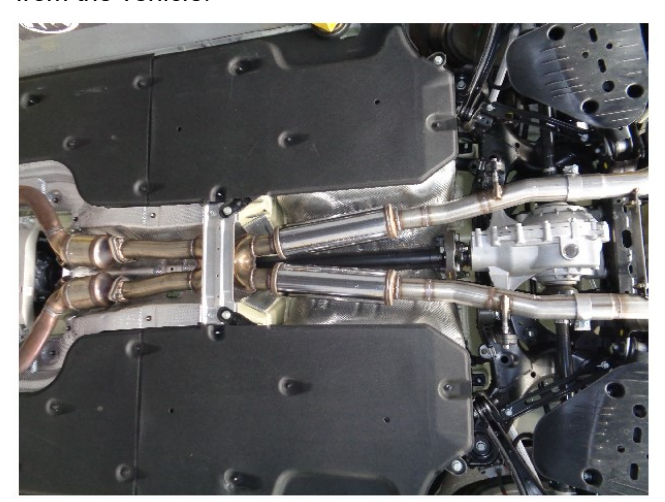
Step 2: Begin installation of the new system by fastening the Resonator Assembly inlets to the catalytic converter using the OEM fasteners (Leave all clamps and fasteners loose for final adjustment of the complete system.)